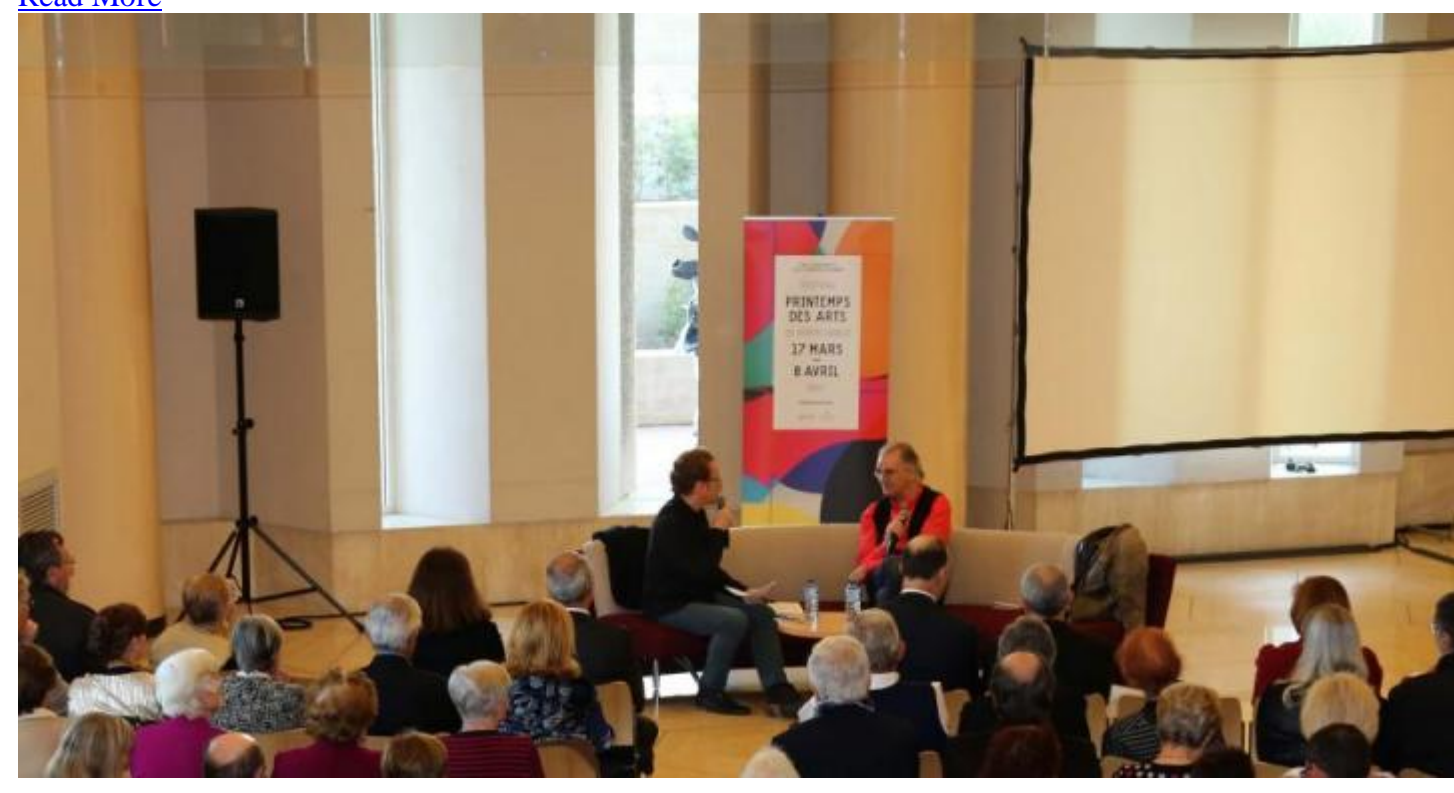
<u>Talk - "Brahms before his soloists"</u> Saturday 23 March - 18h30 Auditorium Rainier III <u>Read More</u>