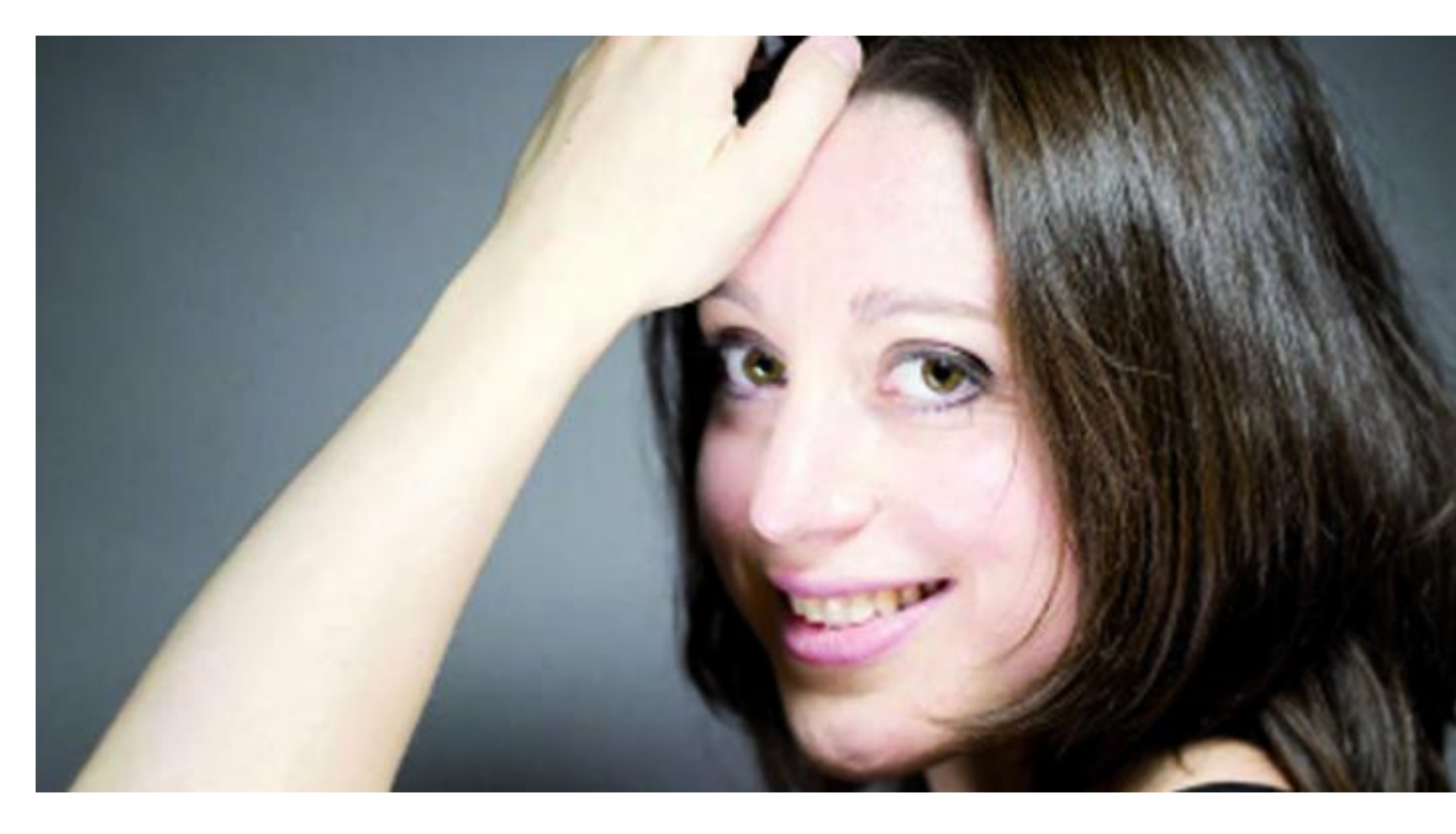
CD concert (1)