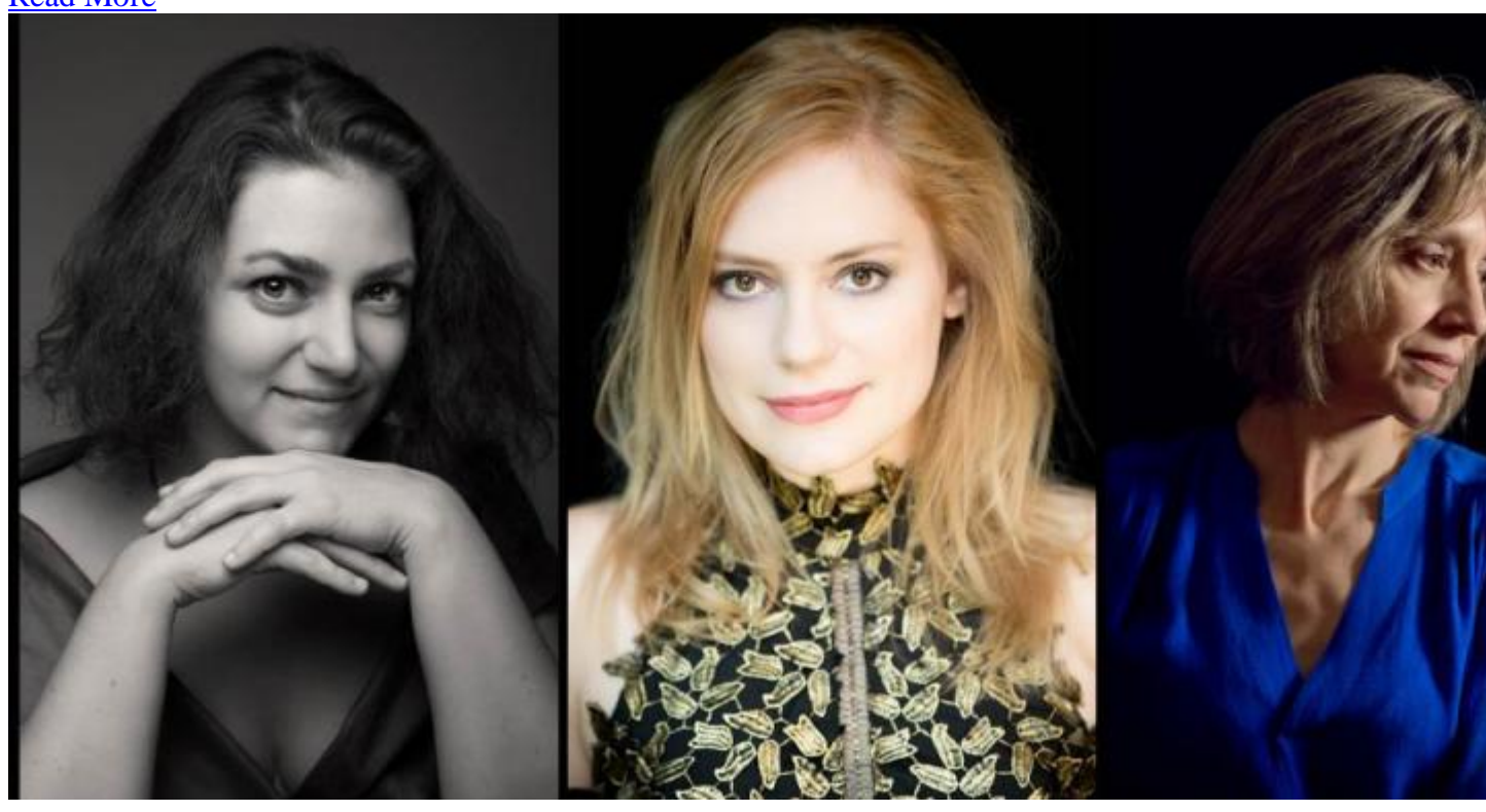
<u>Piano Night</u> Saturday 13 April - 18h00 Musée Océanographique <u>Read More Booking</u>