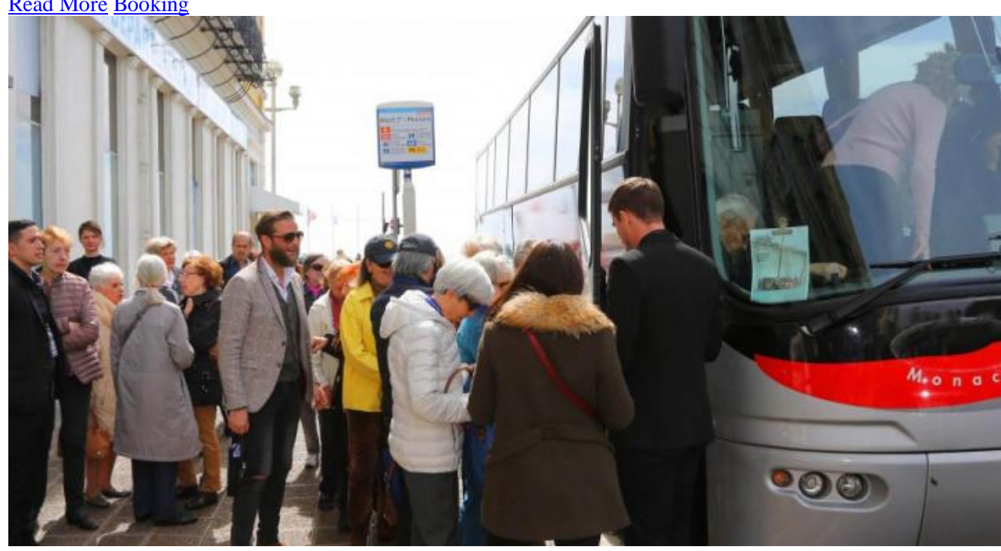
Surprise Trip! - from Monaco Sunday 24 March - 13h30 -Read More Booking