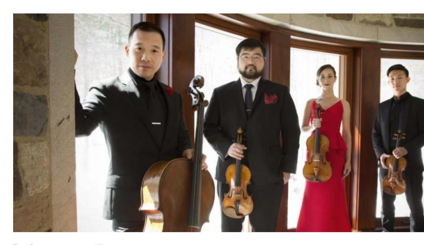
Beethoven quatuors (1) Sunday 17 March - 18h00 Salle Empire - Hôtel de Paris Read More Booking