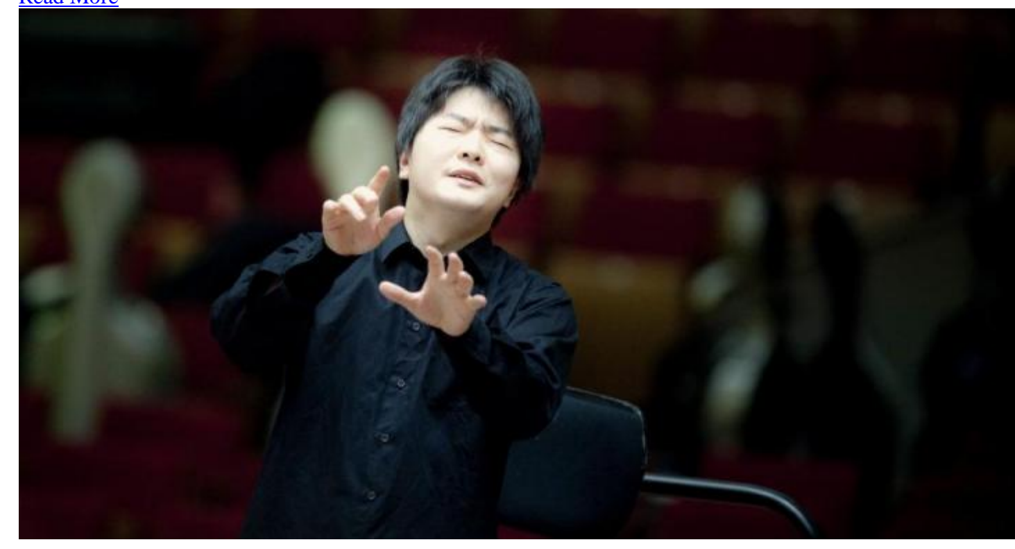
Brahms concertos (2) Sunday 07 April - 18h00 Auditorium Rainier III Read More Booking