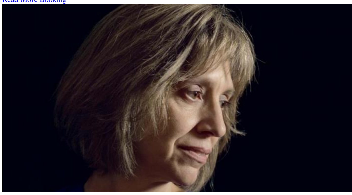
<u>Master-class - piano</u> Saturday 13 April - 10h00 Académie de Musique Rainier III <u>Read More</u>