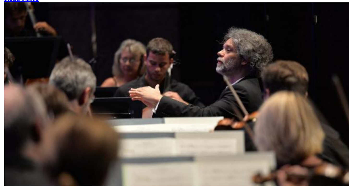
Beethoven - Piano concertos n°2, 3 et 4 Friday 15 March - 20h30 Auditorium Rainier III