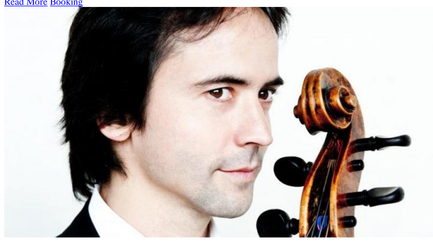
Meeting with Jean-Guihen Queyras, cello Sunday 07 April - 11h30 Café de la Rotonde, Opéra Garnier Read More

<u>Music into space</u> Saturday 06 April - 20h30 Salle Omnisports, Lycée hôtelier <u>Read More Booking</u>