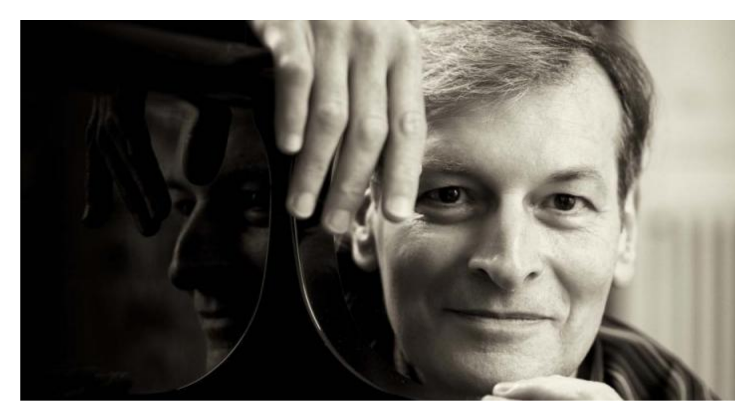
Brahms concertos (1) Saturday 23 March - 20h30 Auditorium Rainier III Read More Booking