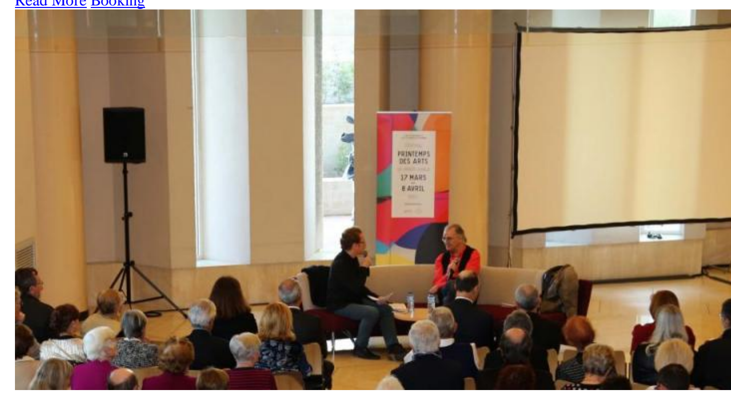
<u>Talk - "Is the alto the fifth wheel in the quartet?"</u> Friday 29 March - 18h30 Musée Océanographique <u>Read More</u>