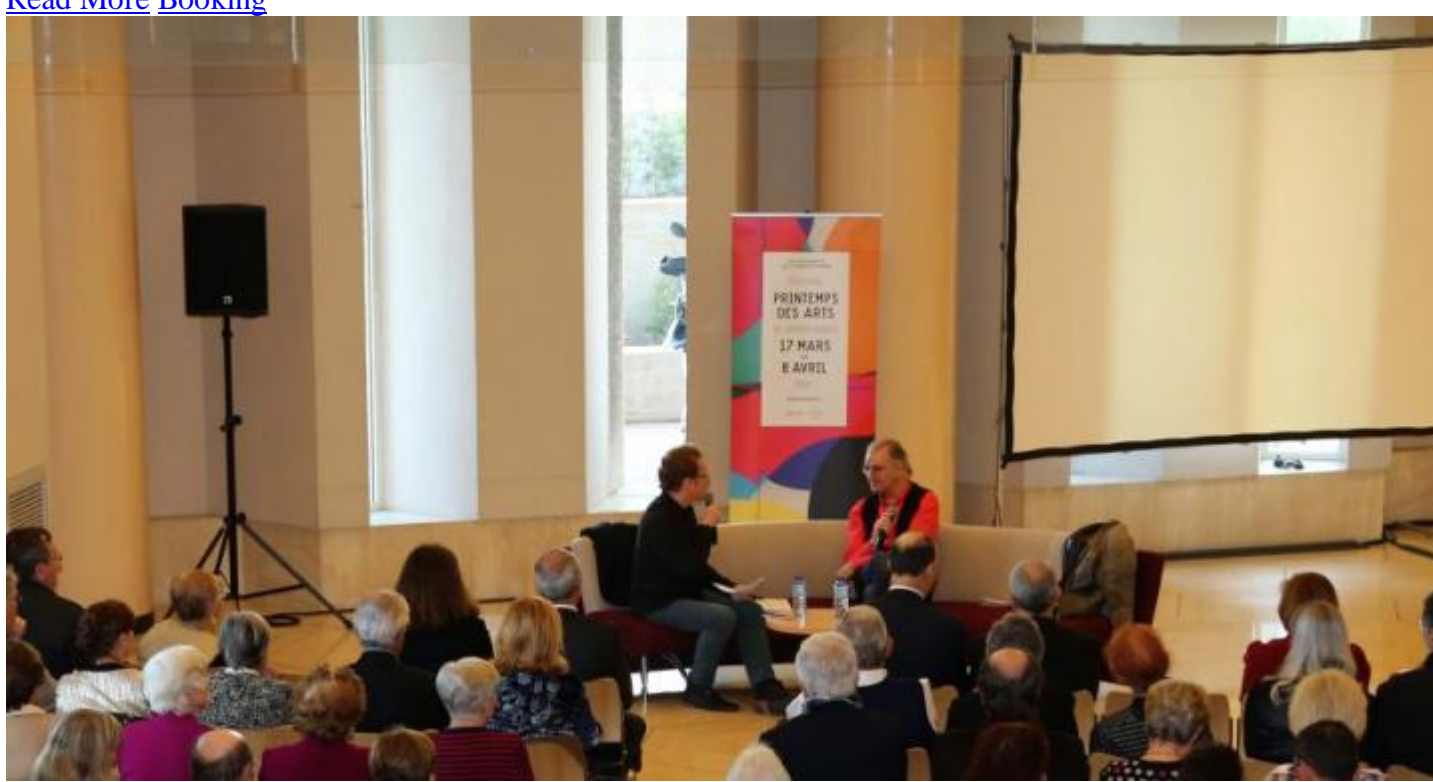
<u>Talk - "Beethoven, heir or reinventor of the quartet?"</u> Sunday 17 March - 16h30 Hôtel de Paris Read More