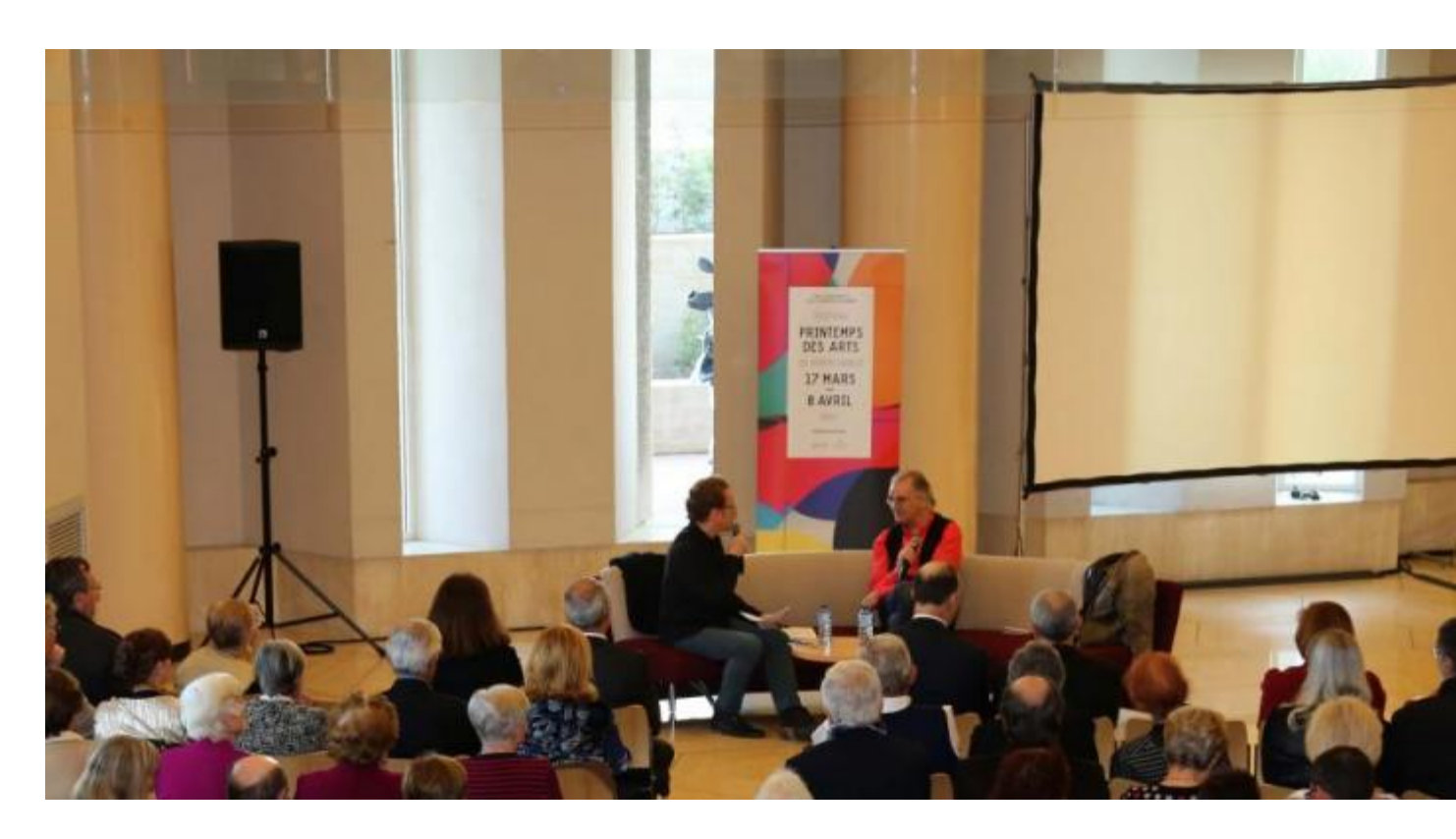
<u>Talk - "Bartók's concertos: studiedly popular music"</u> Sunday 31 March - 16h30 Crazy Fish, Grimaldi Forum <u>Read More</u>