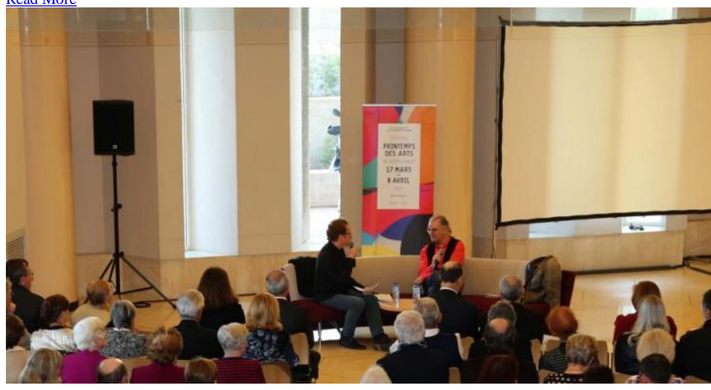
<u>Talk - "Conducting from the piano"</u> Saturday 16 March - 18h30 Auditorium Rainier III Read More