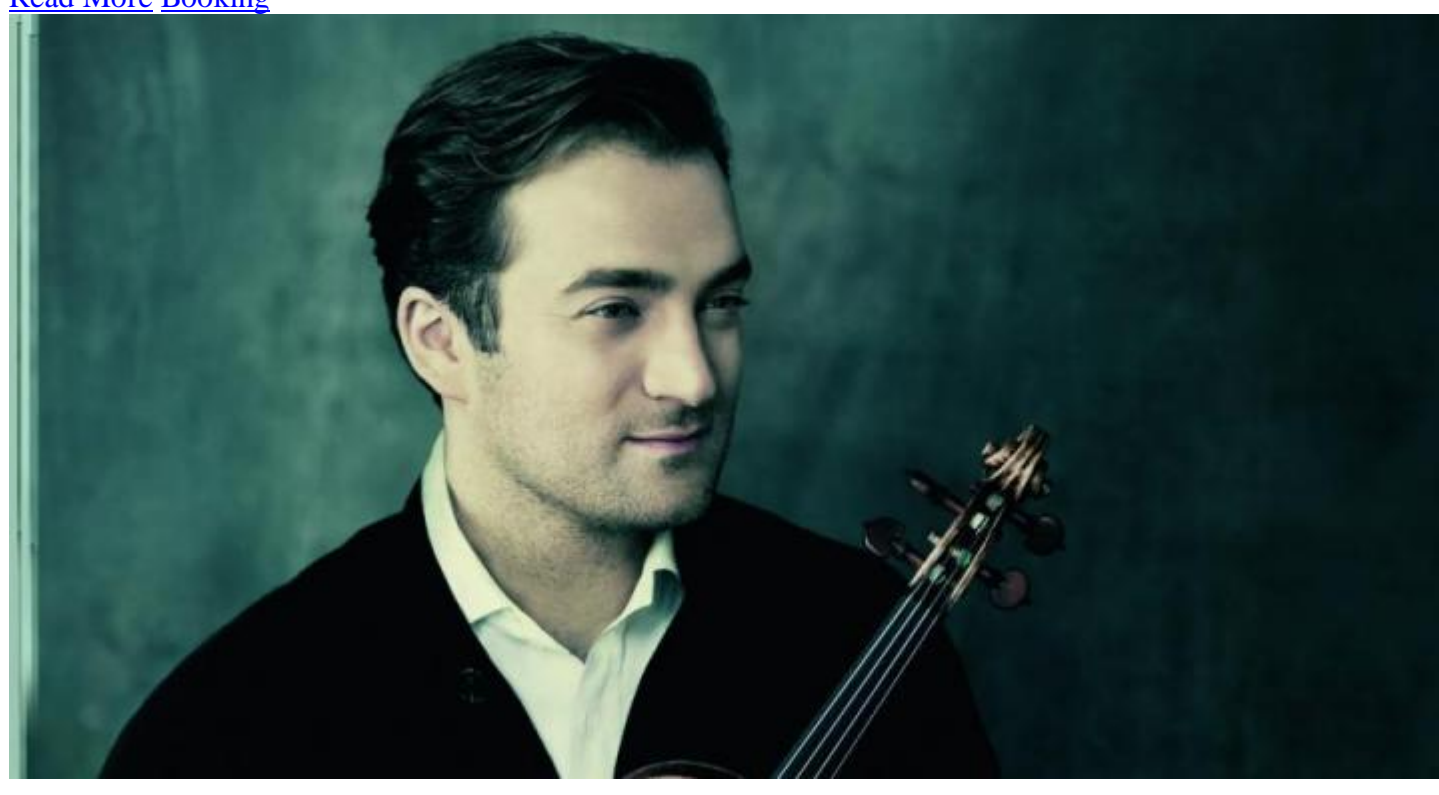
<u>Talk with Renaud Capuçon, violin</u> Saturday 30 March - 11h30 Café de la Rotonde, Opéra Garnier Read More

Beethoven quatuors (3) Friday 29 March - 20h30 Musée Océanographique Read More Booking