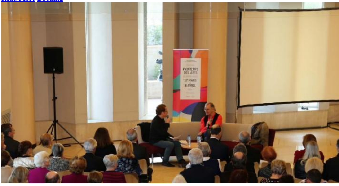
<u>Talk - "Beethoven's last quartets"</u> Friday 22 March - 18h30 Hôtel de Paris