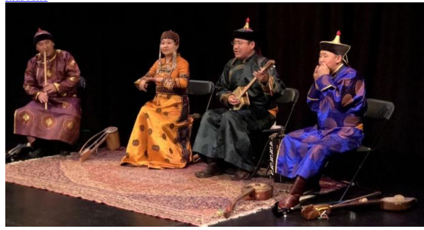
Mongolian traditional musics and songs Sunday 14 April - 18h00 Opéra Garnier Read More Booking