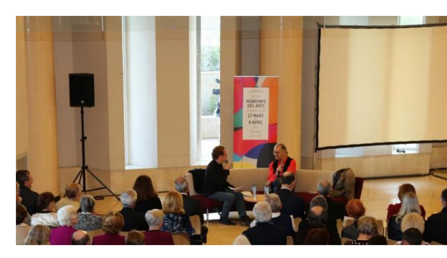
<u>Talk - "Mongolian music and song, an overtone world between the steppe and the Altai"</u> Sunday 14 April - 16h30 Hôtel de Paris <u>Read More</u>