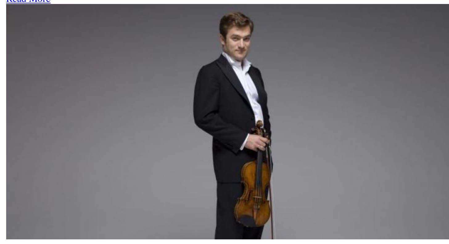
<u>Bartók concertos</u> Sunday 31 March - 18h00 Grimaldi Forum <u>Read More Booking</u>