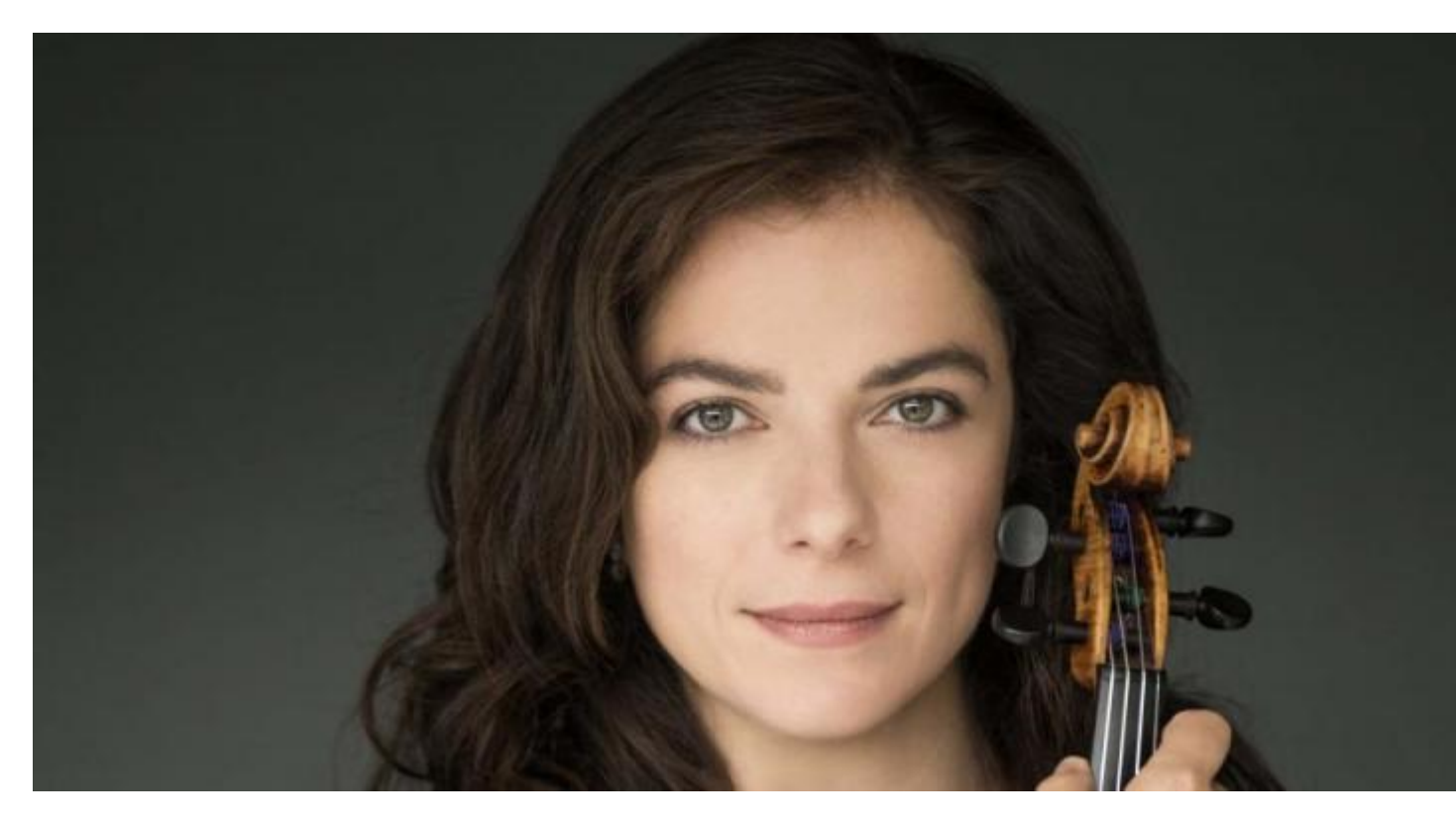
WEEK 3 - From Wednesday 27 to Sunday 31 March 2019

<u>Surprise Trip! - from Nice</u> Sunday 24 March - 14h00 -<u>Read More Booking</u>