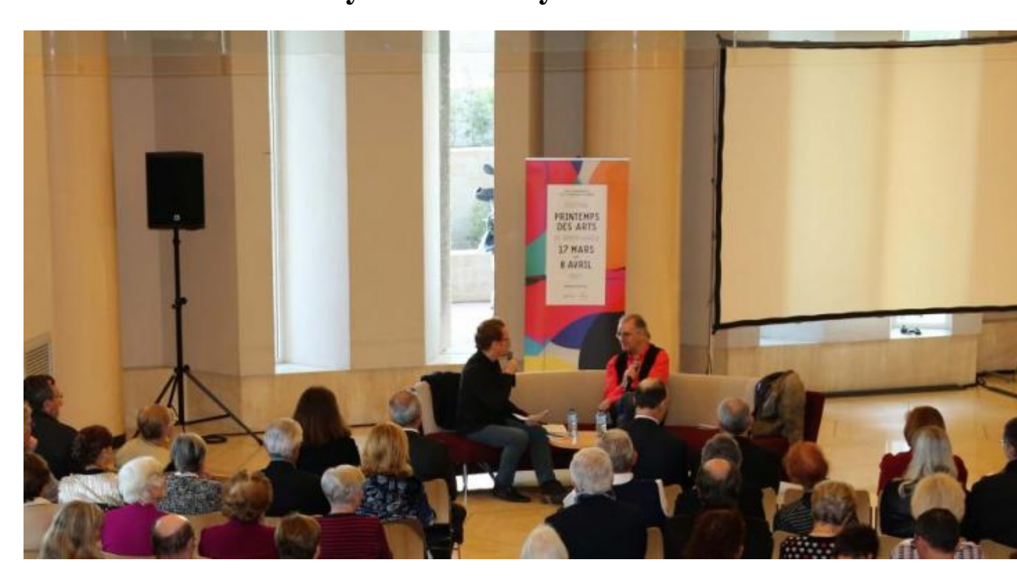
<u>Talk - "What kind of pianist was Beethoven?"</u> Friday 15 March - 18h30 Auditorium Rainier III <u>Read More</u>