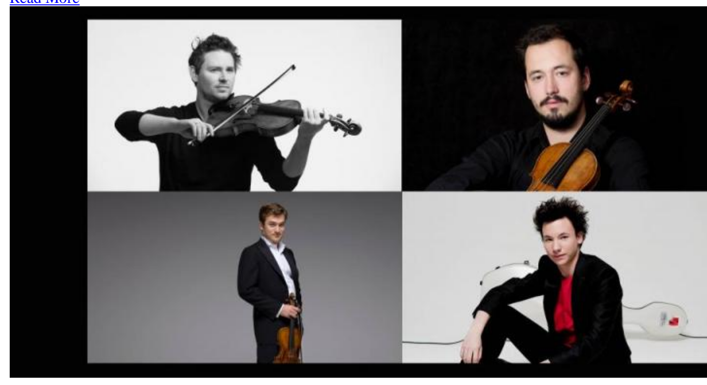
Beethoven quatuors (4) Saturday 30 March - 20h30 Opéra Garnier Read More Booking